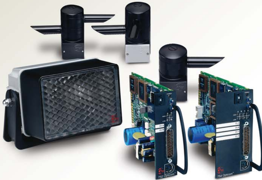
Opticom™ Infrared System components: detectors (top), emitter (left), phase selectors (right).

Contact Global Traffic Technologies to learn more about service, maintenance and turnkey solutions in emergency vehicle preemption and transit signal priority that improve the quality of life for everyone in the community. Call 1-800-258-4610 , or visit us at gtt.com . The method of using the components of the Opticom™ Infrared System may be covered by U.S. Patent Number 5,172,113 and Canada Patent Number 2,079,293. The use of Opticom infrared system components may be covered under one or more of the following U.S. Patent Numbers: 4,970,439; 5,187,373; 5,187,476; 5,202,683; D338165.